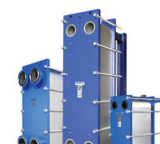
Plate Heat Exchangers Accu-Therm® Temp-Plate® Brazed Plate Heat Exchangers